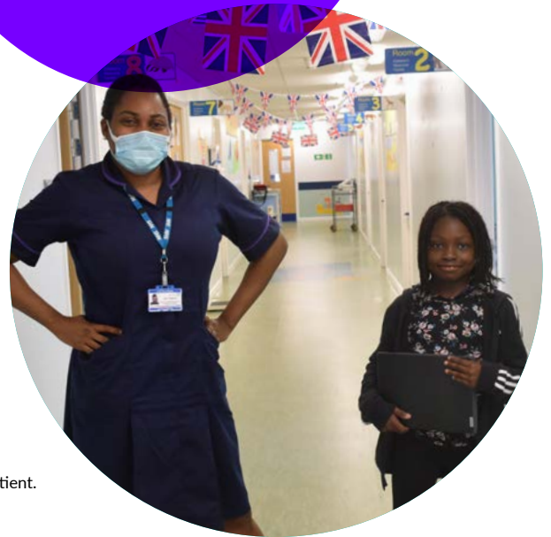
Alero with a young patient.